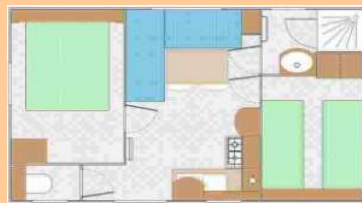
Mobil-home 22 m 2