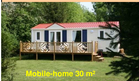
Mobile-home 30 m 2