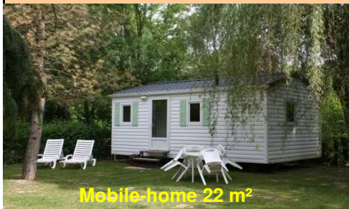
Mobile-home 22 m 2

The renting starts from midday to midday. Thank you kindly leave the rental before noon