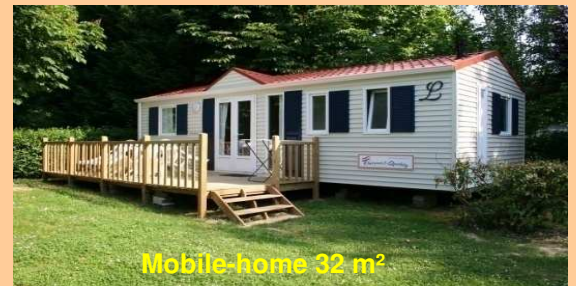
Mobile-home 32 m 2