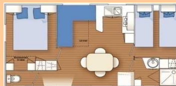
Mobile-home 30 m 2